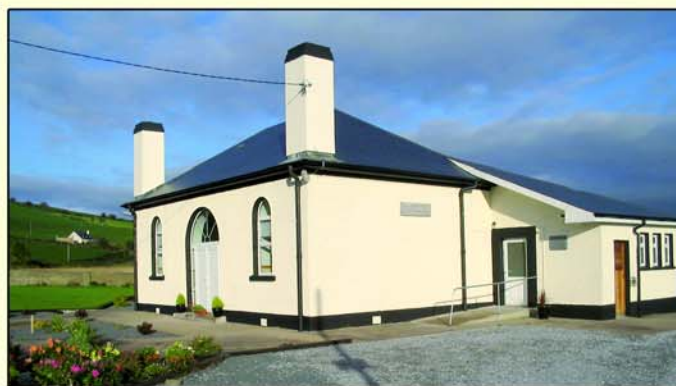
Laharn Heritage Centre

Regardless of the weather, the dancing continues as it is only a hop, skip and jump to the newly refurbished Laharn Heritage Centre where the fun can continue indoors. Located one kilometre from Laharn Cross, the centre also provides a base for regular winter storytelling, music and singing sessions. (Rambling house session takes place on the third Friday of each month from October to April - 9.30pm - 12 midnight).