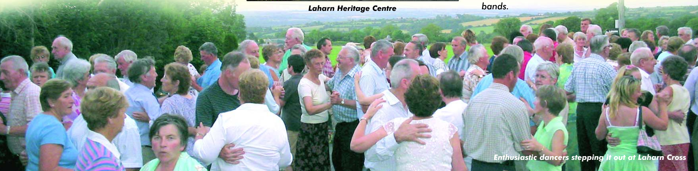
Enthusiastic dancers stepping it out at Laharn Cross

Everyone's invited; the fun is free, though we do ask people to throw a few euros in the donation boxes which goes towards the cost of the live bands.