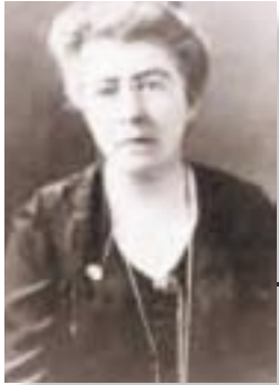
Hanna Sheehy Skeffington – Women And The Right To Vote