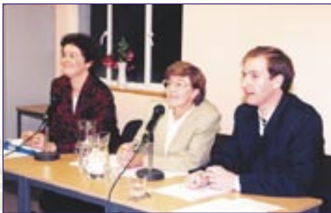
Launch of the Duhallow Women's Forum

in local decision making structures including the Board of IRD Duhallow and a number of key working groups. Also the Women's Forum is affiliated to the National Women's Council of Ireland thus allowing it to play a significant role in local and national policy and decision making.