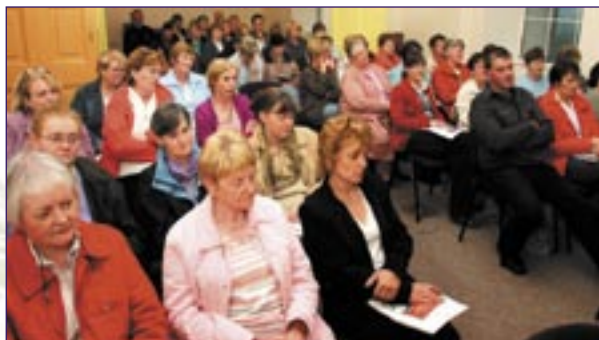
A great attendance gathered for the 2002 International Women's Day Information evening on Stress Management