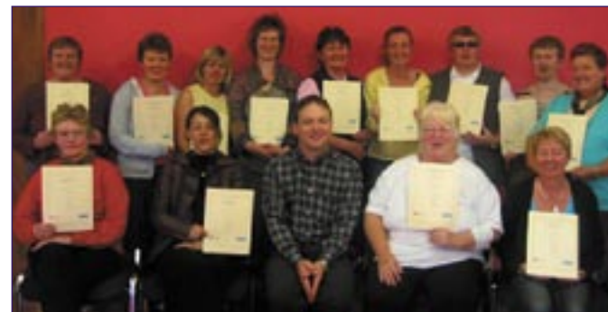
Members of Deciding Your Future Training Course receiving Certification