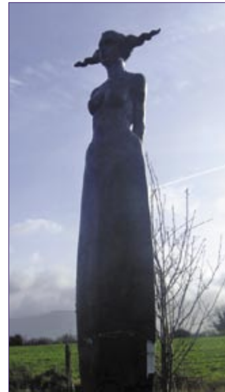
Depiction of the Goddess Danu

Danu: Danu, sometimes referred to as Anu, is the ancient Celtic goddess of fertility, prosperity and comfort. Danu's primary associations are with the processes of the agricultural cycle, as throughout Europe Britain and Ireland, in particular Munster; she was highly revered by pre-Christian agricultural communities as the guardian of cattle and health. Few stories about Danu have survived, and yet the reverence in which she was held still remains. Danu is being honoured by the Forum through the dedication of a sculpture and a conference. The monument is being raised in Rathmore near the Paps Mountain or also known as The Paps of Danu.