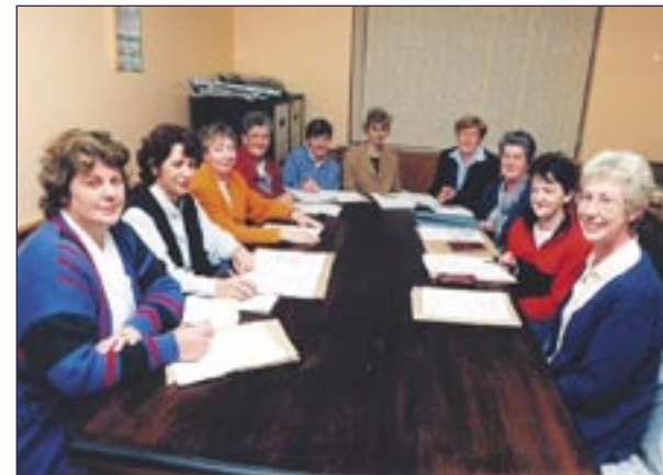
Members of the forum in its early stages of development

community to the Forum and from the Forum back to the representative's group and community. It is very much a two way process.