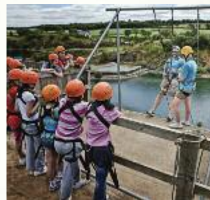
Outdoor activities at Ballyhass Lakes, have been developed through LEADER.

Ballyhass Lakes is a unique outdoor activity and angling centre outside Kanturk. It caters for School Tours, Team Building and outdoor activity enthusiasts who can take part in a range of outdoor activities. Two new attractions are being developed with LEADER support, a Gravity Swing and a Free Fall Device. The addition of these products will enhance the facility and help increase tourist footfall and encourage repeat business.