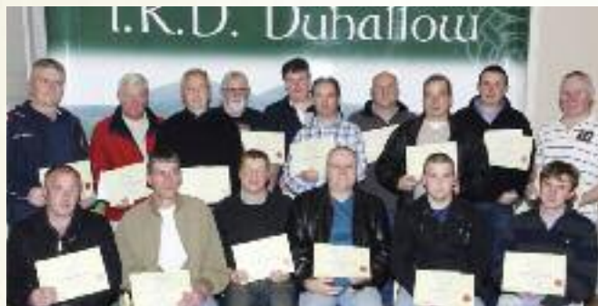
Members of the Water Meter Installation Training come together to receive their Certificates.