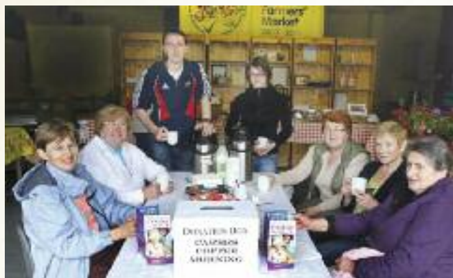
The Duhallow Carers Coffee Morning was held in Kanturk Farmers Market during Carers Week to raise awareness of issues and services.

Caring can be a lonely world. Family and Voluntary carers can spend most of the day with the person they are caring for and these people often cannot hold a conversation and many are not even conscious of their surroundings. The workload and stress of being a carer tends to be unseen and is often both underestimated and unacknowledged by society, even among those close to carers. Therefore, the social and peer support aspect to the carers group is extremely important for all the group members, as typically carers are more vulnerable and susceptible to poor mental health due to social isolation and the stress of caring duties.