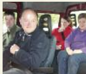
Rockchapel passengers availing of transport twice weekly service

by integrating all transport on a national basis in the future. DART has established its own working group with the relevant stakeholders with a focus on proposals of integration of transport routes in the Duhallow area.