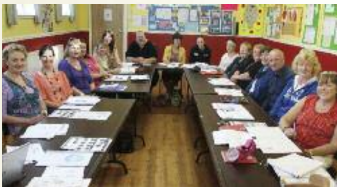
16 individuals taking part in accredited training in Infection Prevention and Control.

IRD Duhallow are given the opportunity to recognise the training that they have received and also to be formally presented with their certificates. In March over 140 people attended the Recognition of Learning Ceremony in the James O' Keffe Institute where Certificates were awarded in courses across-the-board including Computer Training, Water Meter Installation, Carers Courses, Upcycling/Recycling to Personal Development Training.