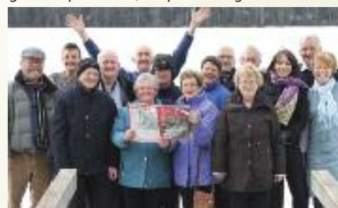
IRD Duhallows SAOI Network bring the "Holly Bough" to one of Finland's frozen lakes during the grundtvig exchange.

the Third Age, Poland obtained funding for a partnership project "Memory Matters". The objective is to target older isolated people through reminiscence and heritage activity. The project placed an emphasis on strengthening education and learning practices within each organisation whilst supporting the exchange, best practices and know how. Members of IRD Duhallow's Saai Network participated in study visits to the adult education services in each partner country. Through this sharing at European level, the partner organisations have found new ways to address the challenges they face, inspiring and developing new approaches to providing quality education for older learners.