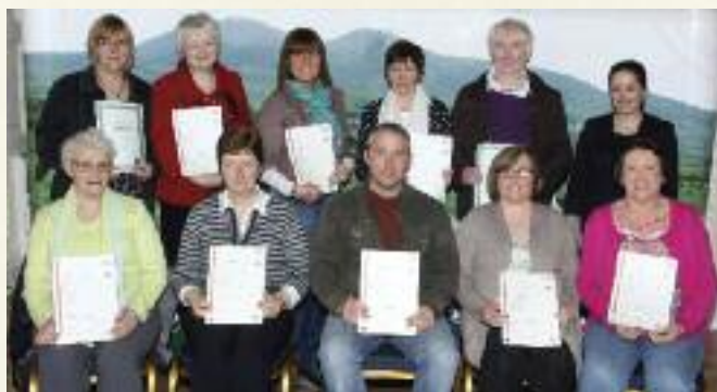
Graduates of the Care in the Home Training Programme which was accredited by City and Guilds and funded by Dormant Accounts.

Care of the Elderly; which was a series of 8 information seminars dealing with topics on caring for an older person, and subjects covered ranged from hygiene, infection prevention and control, to coping with Alzheimer's and dementia.