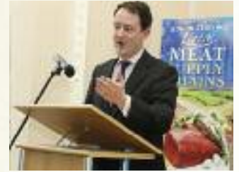
Mr Sean Sherlock, Minister of State for Research & Innovation guest speaker at the launch of Strengthening Local Meat Supply Chains (SLMSC).

SLMSC was launched in Duhallow last November as the project partners completed their first meeting to begin the research phase and needs analysis for the project by Minister for Research & Innovation Sean Sherlock TD. Minister Sherlock was extremely enthusiastic about the scope and opportunities of the project stating that supporting the agri-food sector was vitally important and would be a major contributor to helping Ireland recover economically.