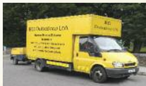
One of the Warmer Home Schemes Vans which is part of a fleet of 5 vans that we have on the road serving North Cork.

This model has the potential to remove, or greatly reduce, the need for state support and it is intended to have a workable model in place by 2014.