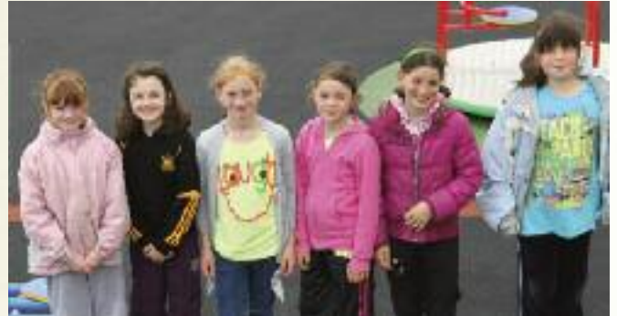
Local children in Lismire enjoy an afternoon of fun at the opening of the new Lismire community playground.

Funded under the Local Community Development Programme, the PAL group comprises of lone parents from around Duhallow. The group comes together to share experiences, enjoy peer support and a chat. Throughout the year they organised seminars to train, inform