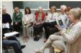
Ciorcal Cainte: Irish speakers enjoying a bit of craic agus cúpla focal for Bealtaine in the Old School House, Foilóighigh.