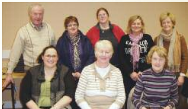
The Duhallow Carers Group who participated in a Computer Course run in association with Caring for Carers.

The Duhallow Carers Group with the support of LCDP funding, organise relaxation and down time for carers promoting social interaction and inclusion. Highlights include the Annual Summer Excursion, the Carers Christmas Party, the Summer BBQ and the Carers Mass. Carers are also encouraged to engage with relaxation techniques and in April 2012 a seminar was held with the Angel Holistic Centre in Kanturk on meditation and holistic therapies. Communication and contact with others is also extremely important, and with the age of modern media, the Duhallow Carers Group in association with 'Caring for Carers' organised a training programme on internet and email. Modules included how to carry out practical transactions online, and to send and receive an email.