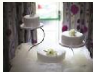
DCFS provides a variety of confectionery for special occasions including wedding cakes and cupcakes which are becoming increasingly popular.