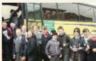
Children of Lyre avail of transport to attend a seminar on the Hen Harrier

DART was piloted in Duhallow ten years ago with an initial 4 routes and 3,272 passengers. In 2011, we had over 50 routes and carried 58,686 passengers. DART has grown to become a lifeline for rural Duhallow, providing access for those most marginalized to towns and villages and ensures access to services.