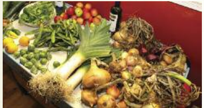
A selection of locally produced food which was produced by members of the GIY group.