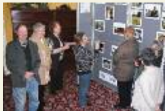
Older Learners enjoying an exhibition of their photographs having completed a LEADER funded Photography/ICT course.

SAOI represents 16 different actively retired groups which IRD Duhallow has established throughout Duhallow and acts as an advocate for the 'Third Age'. SAOI promotes the participation of older people in local decision making processes as well as encouraging and supporting them to avail of the various opportunities that arise. The support infrastructure provided by SAOI plays a central role in the promotion of IRD Duhallow's demand responsive services, such as provided by the Warmer Homes Scheme, the Care and Repair Programme, the Duhallow Area Rural Transport and the rural meals service provided by Duhallow Community Food Service.