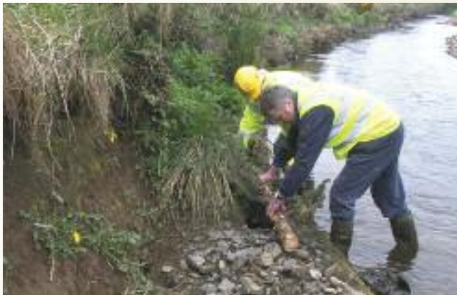
RSS participants repair a section of damaged bank revetment originally placed by Inland Fisheries Ireland on the River Allow at Freemount.

Survey work highlighted areas where otter numbers were low. Otter holts (homes) were constructed and placed at suitable locations. Bird boxes were also strategically placed at bridge sites. Initial results are very promising as approximately 40% of the sites where bird nest boxes were placed were subsequently occupied.