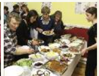
A large crowd enjoyed the Harvest Festival meal, prepared by the staff of Duhallo Community Food Services.