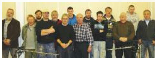
20 Individuals were trained in Saor TV, Freeview & Digital TV Installation Training.

In January, IRD Duhallow trained 20 individuals to become certified in Saor TV, Freeview & Digital TV Installation. Ireland is now in the process of entering National free to air Digital Broadcasting. At the time the training took place there were at least a quarter of a million households that were still reliant on the analogue service. This analogue TV Network is to be switched off in October and these participants are in a position to install the new boxes.