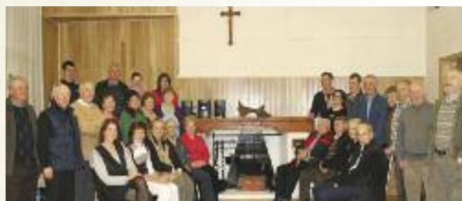
Members of Folloighig Development Association at the official reopening of their Old School House which was funded through LEADER and now provides a multipurpose community centre for the area.

Tackling rural community issues often involves adapting to changing circumstances in rural areas, which may be driven by various factors including: demographic changes and the reduced dominance of traditional rural business sectors. Duhallow has experienced significant socio-economic and demographic changes over the past decade. Such changes can sometimes be considered problematic but many community development opportunities can actually be created by embracing change. The old schoolhouse in Glash has been a