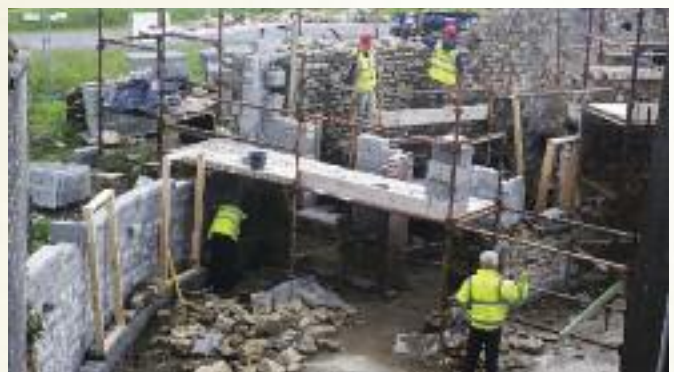
TÚS participants learning new stone work skills to reconstruct the old 'Smoke House' building on the grounds of the James O'Keefe Institute, Newmarket.

With cutbacks in funding, we are still awaiting a CSP programme for the REVAMP furniture recycling project. However, TÚS provided and ideal opportunity to initiate the project. We collect in any unwanted furniture from the public and set about restoring it with a view to selling on a nominal fee to disadvantaged people who are not in a position to pay full price.