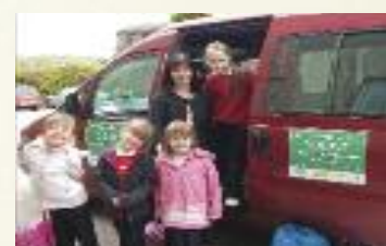
DART provides a transport to children attending Newmarket Afterschools.

DART continues to provide transport for children from their schools to Newmarket Afterschools. This service ensures parents can access employment opportunities content in the knowledge that their child has been collected and transported safely to the afterschools. DART has expanded its transport to three services for individuals attending COPE Foundation in Mallow and Cork on a weekly basis including a service which transports people to workshops in IRD Duhallow under the REVAMP furniture recycling project. Our eleven evening services allow for both young and old to access social and educational events held in communities. Swimming lessons for primary school children continue to be supported along with social and educational outings.