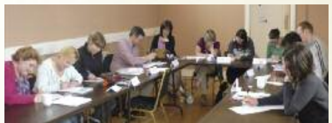
Participants of recently held workshops get an insight into Interview Preparation.

"Pathfinder". Pathfinder is a tool that when used can help individuals assess what options are available in terms of Career Interests, Job Matching and information concerning training supports. Job-seeking Workshops and Interview preparation Workshops continue to be an important mechanism to assist people effectively search for and gain employment.