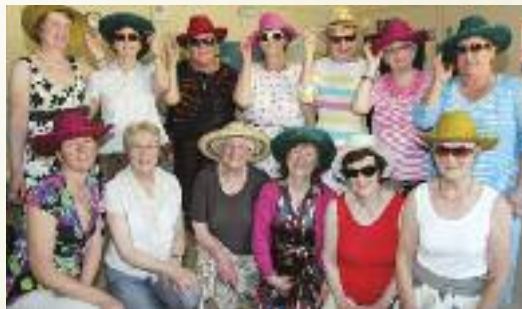
YEEHAW!! Meelin Active Retired celebrate Bealtaine in style with a lunch time Mass and variety concert.

The demographic profile of Duhallow shows over 18% of the population as over the age of 65 years. Life expectancy has risen by eight years as people are living longer and healthier lives and projections forecast a further five year increase over the next forty years (Eurostat). With 2012 designated by the European Commission as the 'European Year for Active Ageing', IRD Duhallow's SAOI Network aims to raise awareness and trigger discussion around improving services for older people, enhancing their involvement in the community and removing barriers between generations. Active ageing includes creating more opportunities for older people. IRD Duhallow's LCDP Strategic plan 2011-2013 sets out actions to be implemented to address the needs of older people to enhance their independence. The LEADER strategic plan targets increasing participation by older people and women in all aspects of community life.