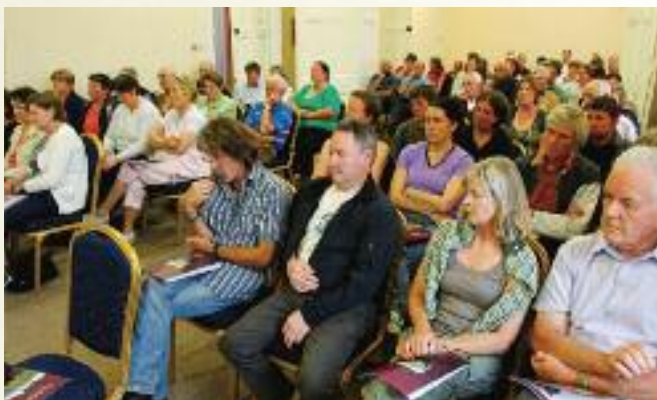
A large crowd attended an information seminar on Beekeeping organised by Duhallo Beekeepers and IRD Duhallo.