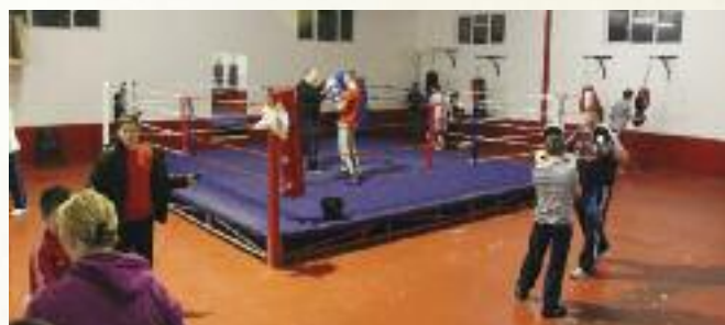
Minority sports are an ideal vehicle for inclusion.

now boasts over 70 members who are competing successfully in local tournaments. Boxing is renowned for the phenomenal level of fitness and athleticism required, and it promotes young people being active and involved in their communities through engaging in a worthwhile sport requiring the utmost dedication. The children train three nights a week and all the coaching and committee time is given entirely voluntarily.