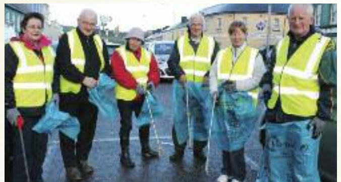
Members of Millstreet Tidy Towns Committee on one of their regular outings to tidy up the roads in Millstreet.

and help support lone parents in their role. They have held First Aid Training, helping lone parents to cope with the frightening situation of what happens when a child gets injured. Mick Corcoran of the Warmer Homes Scheme volunteered to help teach the PAL group members practical tips for D.I.Y. including changing a tyre and bleeding a radiator. A seminar featuring MABs on budgeting and living on a budget and the group also ran a one day seminar on Growing Your Own fruit and vegetables promoting healthy eating and utilising your garden. PAL has a busy programme of activities planned for the coming year and the group is open to all lone parents from throughout the Duhallow region.