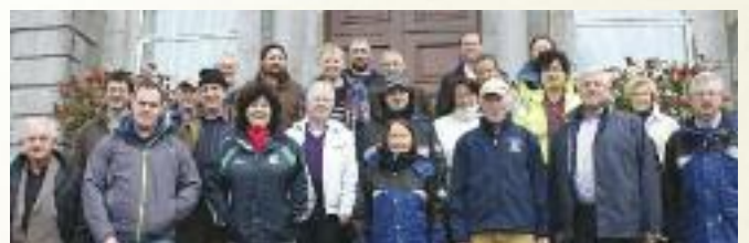
Members of the Coillte District Social and Environmental Panel with members of IRD Duhallow's Environmental Working Group after a very successful stakeholder meeting of the IRD Duhallow LIFE Project.

IRD Duhallow continues to liaise with stakeholders in the catchment. These stakeholders are vitally important to the success of the project as they not only understand the local issues that need to be addressed in the context of the project but also provide valuable advice. Statutory agencies such as National Parks and Wildlife Services are also consulted as these agencies provide the licensing necessary for the monitoring and on-the-ground work.