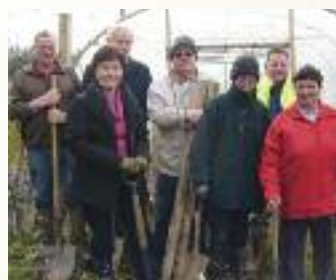
Members of GY Duhallow getting ready to plant Native Trees on the grounds of the James O'Keeffe Institute to celebrate National Tree Week

This year National Tree week took place from the 4th to the 10th March. The Theme this year was "Trees – Our Past, Our Present and our Future. This was a week long festival celebrating all the positive aspects of trees in our lives and environment. IRD Duhallow received trees from Cork Environment Forum which were distributed to 30 groups and schools in the Duhallow area as well as prompting people to plant more trees it was also a means to celebrate our remarkable heritage of tress and woodlands.