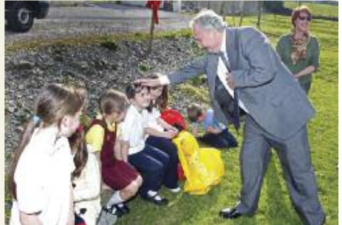
Minister for Communications, Energy and Natural Resources Pat Rabbitte, making new friends at the Newmarket Afterschool as he sees first hand the benefits to the rural people of Duhallow.

Accessible reliable and affordable childcare may sometimes be a challenge for rural working families. The seven Community Childcare facilities animated and supported by IRD Duhallow in their development continue to promote participation in community development and the workforce, and despite the current economic downturn all are at a maximum capacity catering for over 500 children.