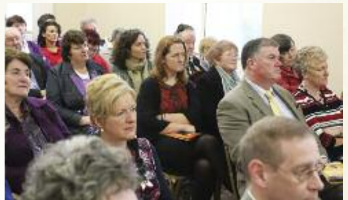
Community participation is high in Duhallow.

A number of information lectures were organised to increase awareness of the project locally. A project update was given to highlight the successes of the project to date and the challenges ahead. It is planned to produce information leaflets to provide information on some of the techniques being developed by the project team with particular tips for farming for the environment.