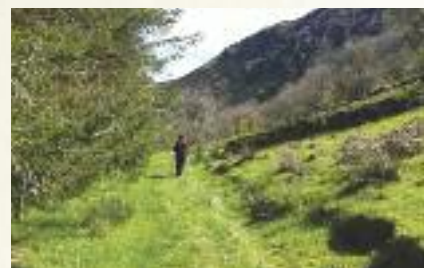
The newly developed Clara Loop Walk which was funded by LEADER.

Sports Council of Ireland. The RSS and more recently the Tus schemes have played an essential role in upgrading and maintenance of our walks. The Walks Scheme supports landowners as they maintain the walk ways through their land.