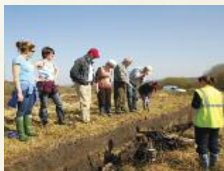
Participants on the Eco Tourism Training on site examining the possibility of tourism developments through existing bogs.