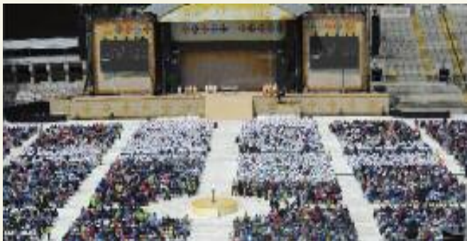
The Eucharistic Congress in Croke Park. The white flooring underfoot was supplied by Allens of Allensbridge who received funding support from LEADER and the Cork County Council Economic Fund.