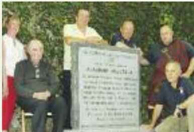
Representatives from Castlemagner Historical Society at the official unveiling of their plaque in honour of Sir Alastair MacColla in Clonmeen Graveyard with representatives from a Scottish Historical Group who visit annually.

preservation of our heritage and culture is vital for the future. Kilbrin Community Council worked with their local primary school to find the 'oldest toy in the parish' which was a fun way for children to become involved in their local heritage.