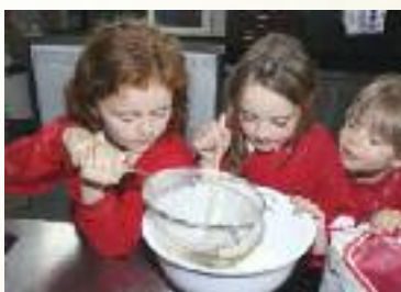
"Many hands make light work" – children at the afterschools getting a taste for baking.

Children have the opportunity to interact outside of school with their peers and the provision of camps during the Easter, Halloween and Summer Breaks also facilitate this. The camps vary from IT camps to Baking Camps. The Community Childcare Subvention Programme (CCS) plays a vital role in the provision of an affordable service for parents as it allows for the After Schools to operate on a tiered pricing system which provides a reduction in costs for families in receipt of a social welfare payment or the medical card. This helps to ensure that families regardless of their financial circumstances are able to access our service.