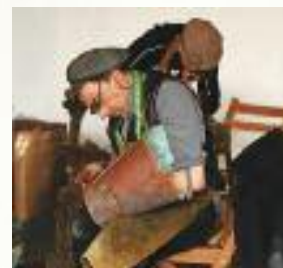
A Tin Smith at the Millstreet Country Park Traditional Craft Fair.

One of the success stories of IRD Duhallow's LEADER Programme has been the development of Ireland's premier Eco Tourist destination in Millstreet Country Park. This breathtaking deer park is situated on the slopes of the Musheramore in the Boggeragh mountain range. It was originally developed in 1992, through LEADER