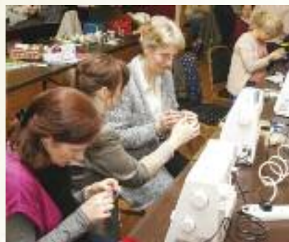
Participants of the Upcycling Recycling Course reinvent their old clothes with new trends.

The Bereavement Support and Domestic Violence Services are delivered through Goal 1 which is limited to 10% of the budget. Our monthly newsletter, a key mechanism for informing the people of Duhallow of the supports available to them is also funded under the same 10% cap. Goals 2 and 3 focus on training and job creation and together hold 80% of the budget. Supports for children with learning difficulties, people with mental ill health, low income farmers, small business start ups and our Job Centre are funded under these goals