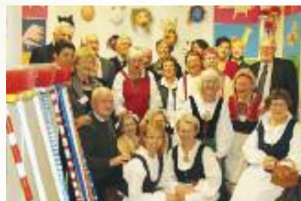
IRD Duhallows SAOI Network members with their Finnish Partners.

the Third Age, Poland obtained funding for a partnership project "Memory Matters". The objective is to target older isolated people through reminiscence and heritage activity. The project placed an emphasis on strengthening education and learning practices within each organisation whilst supporting the exchange, best practices and know how. Members of IRD Duhallow's Saai Network participated in study visits to the adult education services in each partner country. Through this sharing at European level, the partner organisations have found new ways to address the challenges they face, inspiring and developing new approaches to providing quality education for older learners.