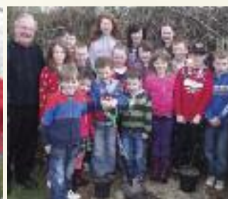
Pupils from Shrone National School who planted tress to mark National Tree Week, 30 groups and schools in Duhallow took part in the initiative.