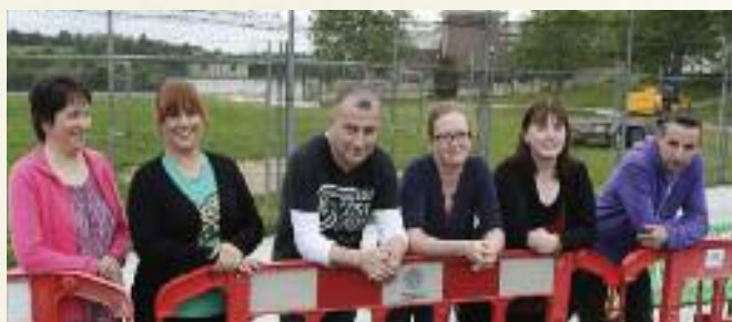
Members of Newmarket Development Association keeping an eye on their as works commence on their LEADER funded project at Newmarket Town Park.

IRD Duhallow has provided support through LEADER for projects that demonstrate appropriate improvements in essential social infrastructure for rural communities, community centres, recreational facilities and amenities. The provision of appropriate meeting spaces for all age groups and sectors of the community is essential for the development of sustainable rural communities. Significant investments have been made by communities across the whole region in community halls, meeting rooms, gyms, walkways, playgrounds, leisure facilities, village enhancements and historical and cultural projects are also featuring. The communities own contribution of matching funding in terms of voluntary labour, donations of land and buildings and hard cash is commendable.