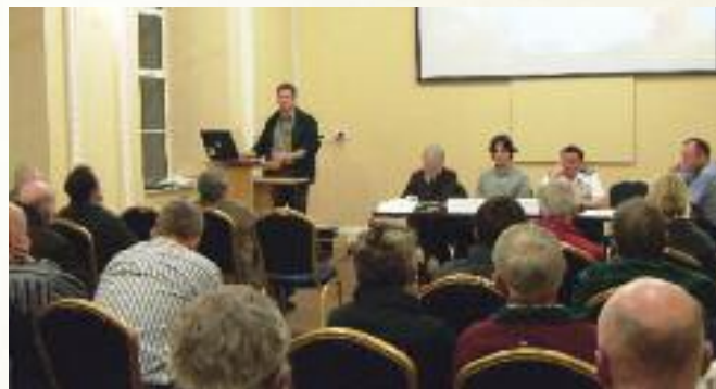
Representatives from the Dept of Agriculture, Coillte, NPWS, An Garda Síochána, and Kerry County Council speaking at a Seminar on Land Burning

The primary aim of Kanturk Farmers Market is to support local farmers who produce food locally with a market for their produce. The market provides customers with a range of naturally produced food at reasonable prices. In the last two years the pace of market growth has slowed and talking to producers at the market it is evident that Kanturk Farmers Market didn't escape the chill wind of recession that is blowing across the county. However for the third consecutive year the market was awarded the Voluntary Code of Good Practice which gives an assurance to customers that in the case of the market in Kanturk 100% of the produce sold is sourced locally. Selling at the farmers market is a stimulus for farmers and their families to supplement on-farm income and is an excellent environment in which to introduce new products to the market.