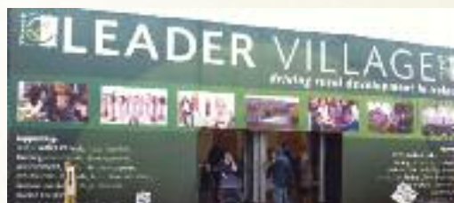
The LEADER village at the ploughing championships which had over 100,000 visitors last year.

It is imperative therefore that in any Alignment Process that the integrity of the Local Development Groups remains intact, by way of Area Based, Bottom-up Local Action Groups, Integrated and Multi-sectoral legal entities separate from Local Government.