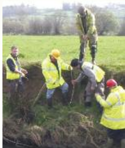
RSS participants plant willow stakes and slips to increase bank protection from erosion by flood waters on the River Allow.

Surveys of the non-native plant, known as the Himalayan balsam, found that the extent of this invasive plant was much more widespread than previously thought. In excess of 18km of banks were covered by the project team. This is the largest Himalayan balsam removal project ever to be undertaken in Ireland and possibly in Europe. Results of this work have been very encouraging and the density of plants recorded in 2012 is much lower than that recorded for 2011. It is important that this work is continued to ensure its long term success. IRD Duhallow would like the public to report any sightings of Himalayan balsam within the Allow River catchment, north of Banteer village.