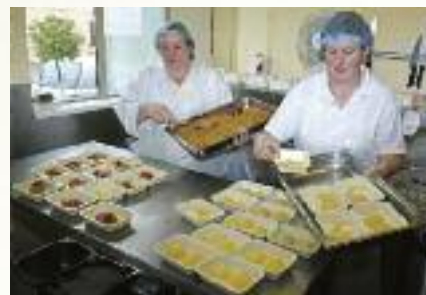
All events are catered for, and advice is offered on menu selection and the type and quantity of food needed for each event. Communion, Confirmation, Birthday parties, and Funeral gatherings are all catered for. There are a large number of options available from finger food, hot and cold fork buffet, salad plates, to seated three course meals.

In the past year the outside catering side of the business has seen good growth and as such has proven to be a very valuable revenue stream to support the meals service.