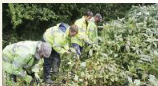
RSS workers continue into their second year of eradicating the invasive Himalayan Balsam from the banks of the Allow River.

Additional survey work was carried out to measure the rate of erosion and suspended solids during flooding periods which is of major concern to both IRD Duhallow and to landowners. Further work by the project team has shown that erosion is particularly severe in some parts of the catchment and is contributing a significant amount of silt to the river bed. Siltation of the river bed is of particular concern for the health of salmon spawning beds and juvenile mussel habitat.