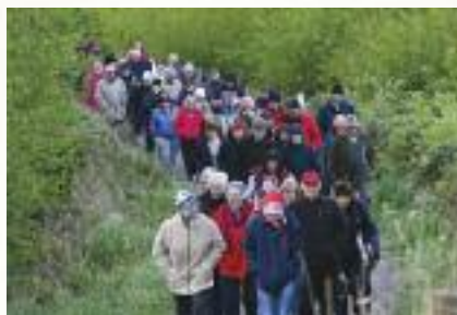
Bird enthusiasts of all ages congregated in the Island Wood Newmarket on a cold and frosty May Morning to witness the wonders of the Dawn Chorus.