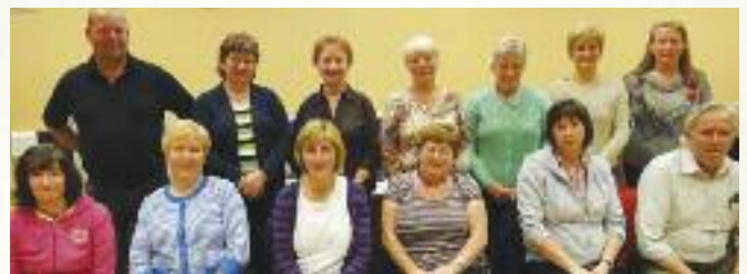
Participants on the Internet and Email Training Course get ready for their seven week training programme.

Duhallow, unlike most local development companies, for historic reasons does not have a Local Employment Service or DSP funded jobs club. Therefore IRD Duhallow set up the Job Centre to meet the needs of people in Duhallow who need assistance seeking employment and also for employers who need support in advertising employment positions. People who are unemployed come from diverse backgrounds and have different needs. As such there is no "one size fits all" therefore through the Job Centre the Working Group aims to offer a number of supports and interventions. These supports include Job Placement, Career Advice, and assistance with writing your CV or Cover letter, Interview Preparation and the provision of