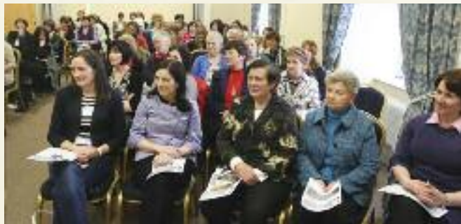
A good crowd attended the "Redesigning your home on a budget" in IRD Duhallow.

Long term unemployment in the region is often compounded with mental ill health, a problem the Department of Social Protection has identified as needing interventions through the Towards Occupation Programme. Sheltered employment opportunities are provided through the Community Services Programme (CSP) in the three Community Enterprise Projects, however IRD Duhallow could provide another 20 part-time CSP funded jobs through the furniture revamp project.