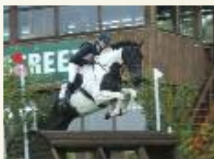
Millstreet Horses Ltd. received funding under the LEADER programme to further develop amenities in the Green Glens Arena