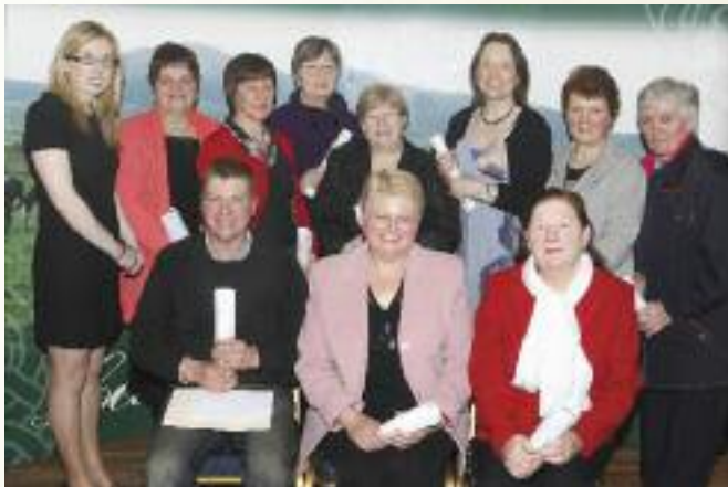
Members who completed the Microsoft Word Training Course receive their Certificates at the Recognition of Learning Ceremony.