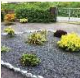
Laharn Cross received grant assistance towards landscaping and signage at their heritage centre and cross roads.