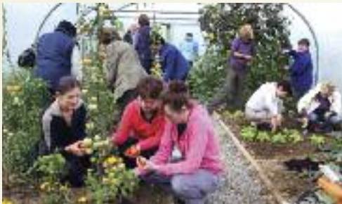
Another successful course being rolled out as a result of the Equality For Women Measure. All hands on deck as participants learn how to Grow Their Own.

Another key area of delivery was the focused Workshops on Seeking Employment. These two workshops enabled women to partake and learn successful techniques to use when trying to secure employment. The workshops rolled out were Effective Job Search Strategies and Interview Preparation Workshops, which assisted the participants to become more aware of their Unique Selling Points and to alleviate the issues of lack of confidence and fear of failure.