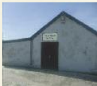
Ballydaly Hall had an extensive paint job by CE participants.

Participants on IRD Duhallow's CE Scheme are supported in identifying career choices through Pathfinder which is a computerised system of career guidance based on skills, interests