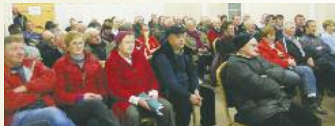
A large group of Duhallow farmers attend a seminar on Herd Health.

Employment Service. We are determined to meet the needs of the unemployed, who should be able to access these supports locally, through our Job Centre which we operate and fund as part of our administration and LCDP.