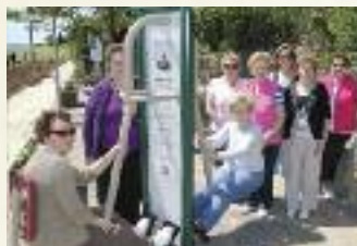
Donoughmore Community Council demonstrate outdoor exercise in a new and different way at the LEADER funded Outdoor Exercise Gym and Walk

IRD Duhallow engages older people in meaningful consultation about the learning needs and supports required through the SAOI Network in order to devise relevant training and skills options for older learners. Photography and Basic IT training has been provided to ensure that older people are fully equipped to embrace technology.