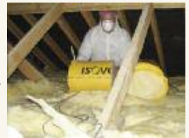
Attic Insulation: Having insulated 400 attics in 2009 and increased our target to 470 attics for 2010. We currently have three teams insulation attics.

In carrying out our insulation work we noticed that several older people's houses needed small repair jobs but had nobody to carry them out. As a result, we established Duhallow Care and Repair in association with Age Action Ireland. The main aim is to carry out necessary small repairs and improvements to the homes of the elderly, enabling them to live independently in the community in increased comfort and safety. To date we have recruited and Age Action Ireland trained ten volunteers. Work is referred to them by our installers. The service is free to those who cannot afford it; they only pay for materials used. We also provide a trade referral system for jobs that need a professional tradesperson from our database of reliable trade's people.