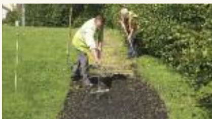
Following a review of the works being undertaken by the participants in Boherbue, huge improvements have been evident in the village. The participants as seen here cleaning the path around the playground.

Without their help, community groups would find it difficult to maintain the high standard of the community facilities which they have achieved.