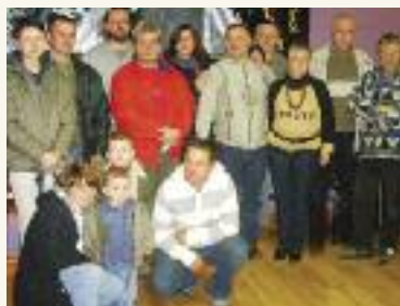
Polish and Lithuanian Community attend the Social Centre in the Trade Union Hall, Kanturk

Since 2007, IRD Duhallow has been successful in its application for funding under the Integration Fund which is administered by the Office of the Minister for Integration through Kerry County Council and Cork County Council for projects at local level. As a result of this fund IRD Duhallow has supported many initiatives including developing a Social Centre for Foreign Nationals in Rathmore and Kanturk, where foreign nationals meet, chat, exchange experiences and avail of training and initiatives organised by IRD Duhallow. The Social Centres operate on a monthly basis where migrant workers can receive and share information about rights and entitlements, public services and local social activities. With IRD Duhallow's Job Centre, one to one supports are offered. The numbers visiting the Social Centres have remained strong and in the current economic climate legally resident immigrants are facing new challenges with unemployment levels still rising. The funding received in 2010 will be provided towards the further development and success of the Rathmore Social Centre.