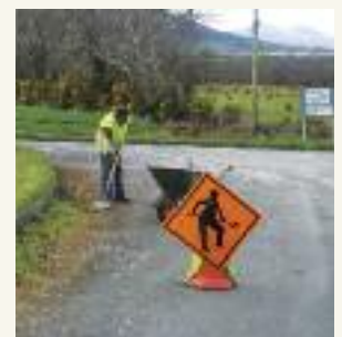
Denis Murphy CE Participant at Crossroads in Ballydaly

The village of Boherbue has two CE participants who have responsibility for the local cemetery, village greens, park and entrance roads to the village. Following extensive surveying of the village during the summer of 2009 and consultation with the local community, the participants have been supported to develop a work plan which ensures the village appearance is good all year round. The supervisor has worked closely with the participants in order to maximise the impact of CE in Boherbue and ensure their work is visible and recognised by all.