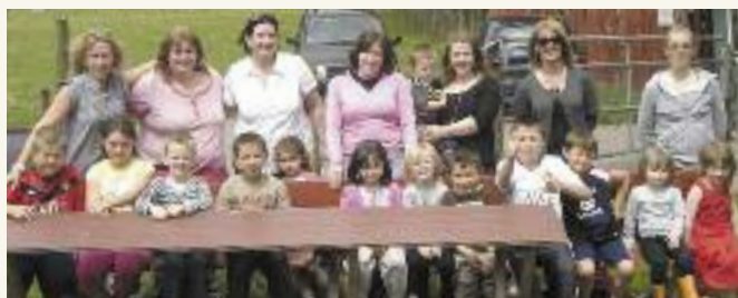
Members of the Parenting Alone group enjoying their annual family day out at Kennedy Pet Farm Killarney