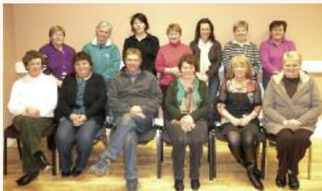
With the roll out of Broadband to rural areas there is strong interest in Internet and e-mail training.

The Job Centre continues to operate the Pathfinder +HE programme