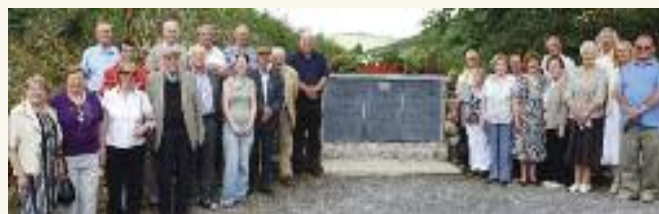
Relatives turn up to see Inchmay Historical Society's monument to the dead and wounded in the 1921 Inchmay Ambush & the Nadd Round Up

Over the past 7 years, IRD Duhallow has developed a voluntary Domestic Violence Support Initiative to raise awareness of domestic violence in Duhallow and ensure the safety of men, women and children in situations of domestic violence. An information brochure has been developed which contains important information including the profile of an abuser, types of abuse and information on where to get help. We have also provided intensive training to a number of volunteers who completed 2 different training courses in this past year to ensure that they can deliver the best information and support possible on our domestic violence helpline. We hope to have this helpline up and running by the end of this year. We have networked extensively with other regions including a field trip to the West Cork Women Against Domestic Violence Project in Bandon. This has helped us to build on the experience of others and we are committed to providing a flexible service that will meet the differing need of the people who will contact the helpline.