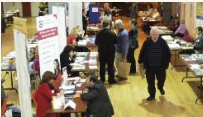
Pathways for Adults Education and Training Exhibition.

Unemployment figures in Duhallow have risen by a dramatic 526 per cent in the last three years. The rise in unemployment occurring across all sectors will be most difficult to resolve in rural areas which are over-reliant on primary industries such as agriculture, construction and low-level manufacturing. People in Duhallow, now more than ever, are experiencing the effects of the economic downturn and are operating in economic circumstances that many have not seen before. The effect of company closures can be seen from IRD Duhallow's Employment and Training Centre with an significant increase in the number of people registered to the job centre. This is collaborated with the increase in persons on the live register from 454 in 2007 to 2,391 in 2010.