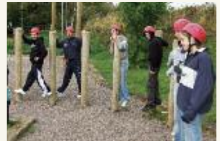
Students on the IRD Duhallow Future Focus Programme which aims to alleviate early school leavers by focusing the student on the requirements of entry to college. Team building is part of the programme and Ballyhass Lakes is an ideal location for this.