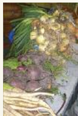
Selection of new season onions, beetroot, parsnips and turnips at Kanturk Farmers Market.

The primary aim of the market is to support local farmers and artisan producers by ensuring they have a direct outlet in which to sell their produce. The increase in demand to purchase high quality locally produced foods has led to the expansion of stalls at the Farmers Market. This year the Market was awarded a Voluntary Code of Good Practice in conjunction with the Department of Agriculture, Fisheries and Food and Bord Bia. IRD Duhallow's market is located at the rear of Twohig's Supervalu in Kanturk and is open from 10.30am -2.30pm every Thursday and Saturday.