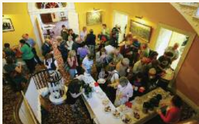
Sharing ideas over a cuppa at the GIY Launch