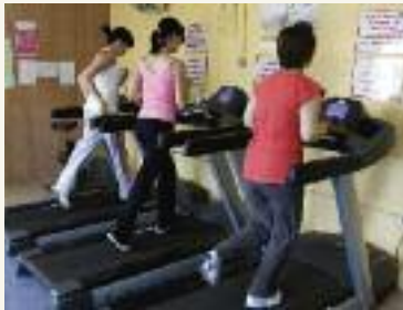
Local Banteer Ladies availing of the facilities in the LEADER funded Community gym in Banteer Community Centre

The Community Development Working Group recognises that community consultation and local volunteerism are key ingredients for successful local community development. The essential ingredients to a thriving rural community include locally relevant facilities and services, achieving fairness for everyone, enriching social capital and empowering local governance. The Working Group continues to support communities to optimise their assets through the bottom up approach. Thanks to our ongoing and sustained support by providing opportunities and motivation, volunteerism is increasing annually in Duhallow