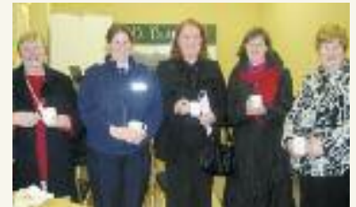
Members of the Duhallow Women's Forum enjoying a cup of tea at their meeting held on International Women's Day

LEADER funding has also been secured to erect a monument to Sr. Mary McKillop, founder of Josephs of the Scared Heart order who inhabited the James O' Keffe Institute for 50 years and over 600 nuns trained and from here they travelled to Australia and New Zealand in order to carry out the work of the order. Sister Mary is to be canonised in October this year.