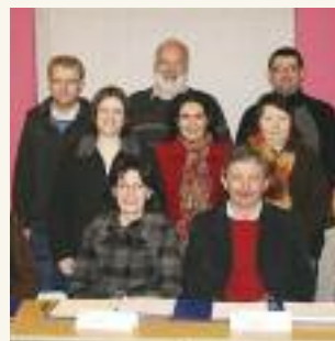
Business Fundamentals Training funded by LCDP and Dept of Social Protection.

Thriving entrepreneurship in all parts of Duhallow is fundamental to our enterprise strategy and to Duhallow's economic growth and employment potential. IRD Duhallow will celebrate Duhallow's next generation of Business Leaders by fostering student Entrepreneurship. Kerry has been awarded European Entrepreneurial Region for 2011 and IRD Duhallow together with the three LEADER groups in Kerry are developing an Inter-territorial LEADER project to fund the LEADER Young Entrepreneur Programme. LEADER Young Entrepreneur Programme will promote entrepreneurship as a natural career choice among the young people of the region. The programme will be rolled out in 18 Secondary Schools in Kerry & 5 Secondary Schools in Duhallow beginning in September.