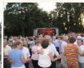
Dancing "At The Crossroads" in Laharn Cross representing a time in Irish history when house dancing was prohibited.