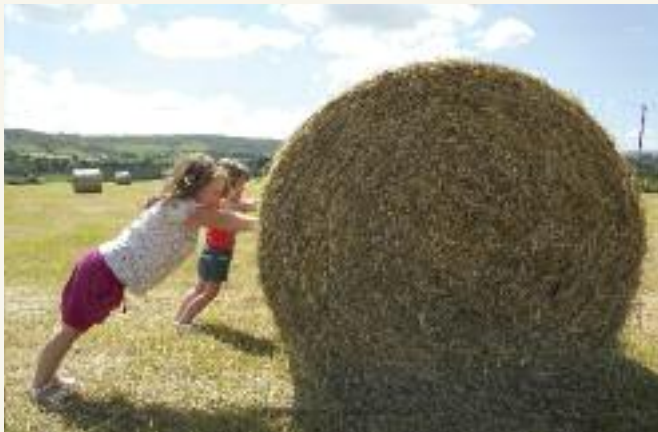
Make Hay while the sun shines, Abigail & Laura Lyons

The Agri-food sector remains one of our most important indigenous sectors accounting for 8.5% of employment nationally. In Duhallow the rate of dependence on agriculture is almost three times the national average and is double the rate for County Cork. Duhallow also has a much higher level of dependency on agriculture than North Cork as a whole. Across the European Community the Agricultural sector is being restructured and represents the largest single economic change since industrialisation. Diversification facilitates farm households to diversify into non-agricultural activities and as a consequence maintain or increase the income of farm families. We need to ensure farm families play an important role in rural development by developing on or off farm rural enterprises to ensure a viable future for the next generation.