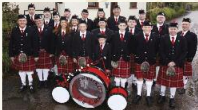
Supporting local events and festivals Newmarket Pipe Band get ready for action.

Newmarket Pipe Band this year produced a book on the history of their band celebrating their achievements since inception in 1963. Millstreet Pipe Band continues to play all over Ireland and are approaching 60 years in existence.