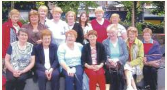
Duhallow Carers on their annual day out: The family carer often finds it's difficult to find time for social interaction. Duhallow Carers Support Group is a valuable outlet for carers in the region.