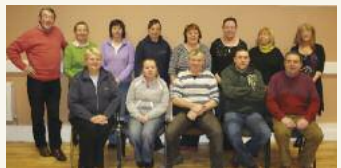
Participants who completed the Basic Computer Training Course which was funded through LEADER.

The Working Group recognises that I.T. Skills are a key necessity and are required in a variety of sectors. Therefore it is a priority that people who do not have any experience using computers, are given the opportunity to close the digital divide before it becomes too wide as