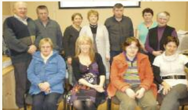
Due to the demand for a second training course for Internet and Email Training IRD Duhallow successfully facilitated a second course in the James O'Keeffe purpose built computer room.

Cork Institute of Technology, NUI Galway and many more. Importantly there were representatives from the Department of Social Protection, Money Advice and Budgeting Services, FAS and Mallow Return to Education to name but a few.