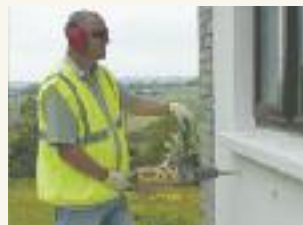
We are registered with the National Standards Authority of Ireland as an approved installer to provide Thermosnug Cavity Wall Insulation.

Cavity wall insulation service was approved and last year we commenced the roll out