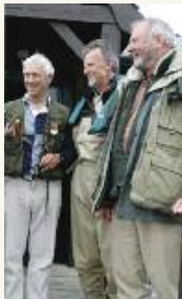
Fishermen from England enjoying an angling holiday at Ballyhass Lakes.

With assistance from LEADER, Kanturk cycling club is currently developing an off road cycling track with velodrome track and will be one of the largest in the country when completed this summer. Community driven developments such as these along with the walks and angling are key to developing Duhallow as a rural recreation centre.