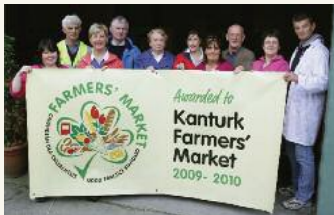
Stall-Holders at IRD Duhallow's Farmers Market in Kanturk, proudly displaying the Voluntary Code of Good Practice Banner which was awarded to the Market in 2009