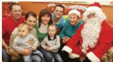
Santa & Mrs. Claus meeting a group of children and their parents during the Multicultural Community Days in Teach Iosagáin, Rathmore.