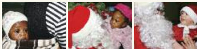
Are we there yet???...Are we there yet???...

An information sign in Braille was designed & created and placed at the 'Time to Talk Time to Listen' picnic gardens in Kanturk. The aim of this project was to promote inclusion within the local community.