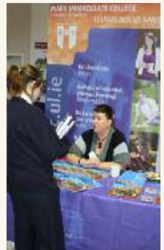
University of Limerick was one of the 25 colleges that exhibited at the Careers Day Exhibition. 10 local schools attended the day which also provided opportunity for parents to access information locally.

The aim of MPF is to offer financial assistance for further and higher education students who are experiencing financial difficulties whilst attending college. Last year 29 bursaries were funded through IRD Duhallow, this increased to 32 for this year, which was a welcomed increase.