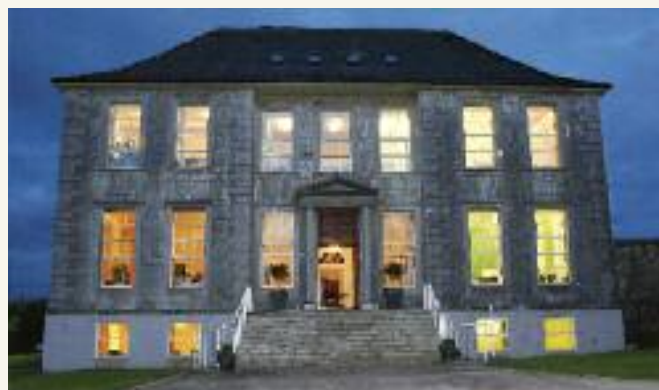
The James O'Keeffe institute is used most nights for LCDP courses.

The LCDP is an integrated programme and encompasses the best of the former LDSIP aiming to tackle poverty and social exclusion through partnership and constructive engagement between Government and people in the most disadvantaged communities through Local Development Companies such as IRD Duhallow. The programme prioritises marginalised people and groups within the most disadvantaged communities, which means that it targets those furthest from access to education, training and employment, and those at highest risk of social exclusion. The programme will continue to work with the target groups/areas and issues as prioritised under the previous programmes based on an identification and demonstration of analysis of local need.