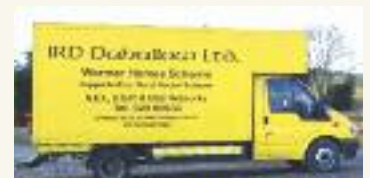
Initially one team of installers was trained but we have set up a third cavity wall team, to deal with increased demand.