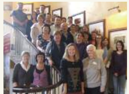
Community Representatives who took part in a 2 day ASIST Suicide Intervention Training Programme in conjunction with the HSE.