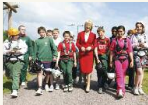
Students from Scoil Ghobnatán in Mallow on their school tour at Ballyhass Lakes Activity centre meet Minister for Tourism, Culture & Sport Mary Hannifin

Minister for Tourism, Culture & Sport Mary Hannifin visited IRD Duhallow's office and launched the Walks Scheme and Ballyhass Lakes activity centre. She was impressed with the offering of Duhallow in tourism terms and the key role LEADER has played in developing a range of products to suit all tastes in rural recreation. She recognised the need to expand our products and we outlined to her our plans to develop our region over the life of this LEADER programme to include the development of Cathair Craobh Dearg as a centre for Druidic and Celtic spirituality.