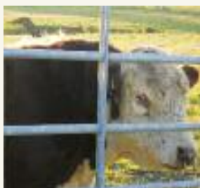
George the Bull, keeping a close eye on his environment.

2010 has been declared the International Year of Biodiversity the purpose is to raise public awareness of the importance of biodiversity and the consequence of its loss. An information seminar on the Birds & Endangered Species of Duhallow proved to be a great success and a broad range of events and measures will continue to be delivered throughout the year.