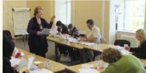
Participants on the FÁS 'Core Skills Training' which ran for 13 weeks and was open to the other Duhallow CE Schemes.

Due to the increasing demands on the scheme from unemployed people, we applied to FÁS for extra places on our current scheme. However, we were not successful and so we have to work within our existing numbers.