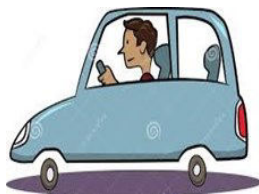
Driver Theory Workshops